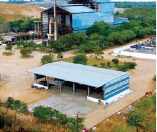
Hazardous Waste Management Plant, Hyderabad