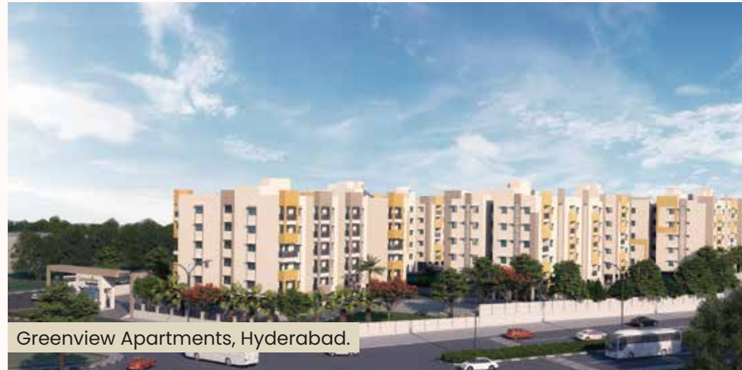
Greenview Apartments, Hyderabad.

Spread over 3.81 acres, the 200 apartment units nestled in Ramky Discovery City are a gorgeous blend of elegance and convenience. Adjacent to the lush green reserve forest, the apartments are about 10 minutes away from the Hyderabad international airport. With a host of residential, commercial, educational, and entertainment options, Greenview Apartments are well equipped to provide residents with world-class amenities and conveniences.