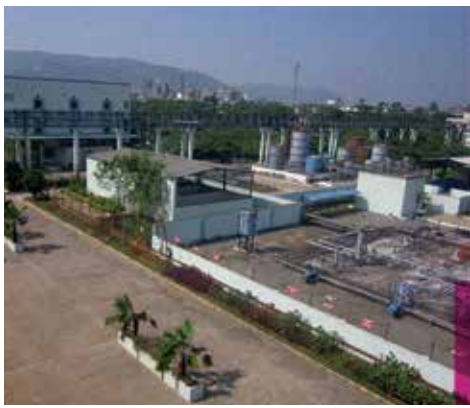
Smilax Laboratories, Hyderabad