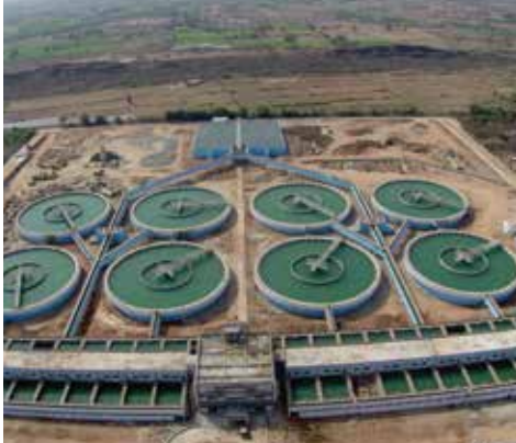
410 MLD Water Treatment Plant, Nalgonda - Telangana