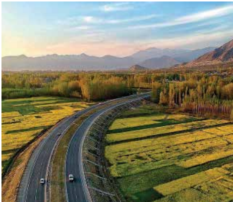
Srinagar - Banihal Expressway