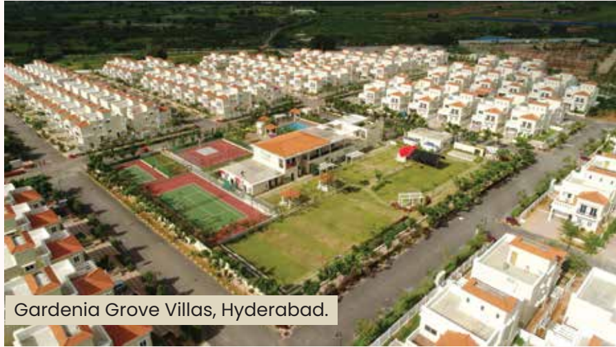
Gardenia Grove Villas, Hyderabad.