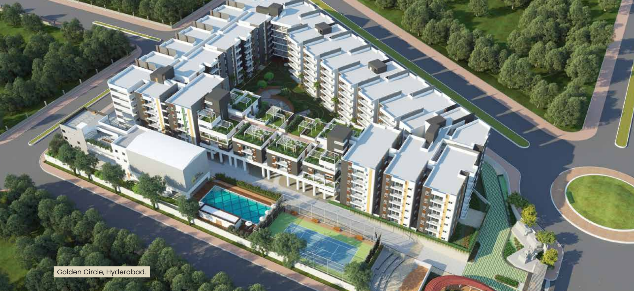
Golden Circle, Hyderabad.