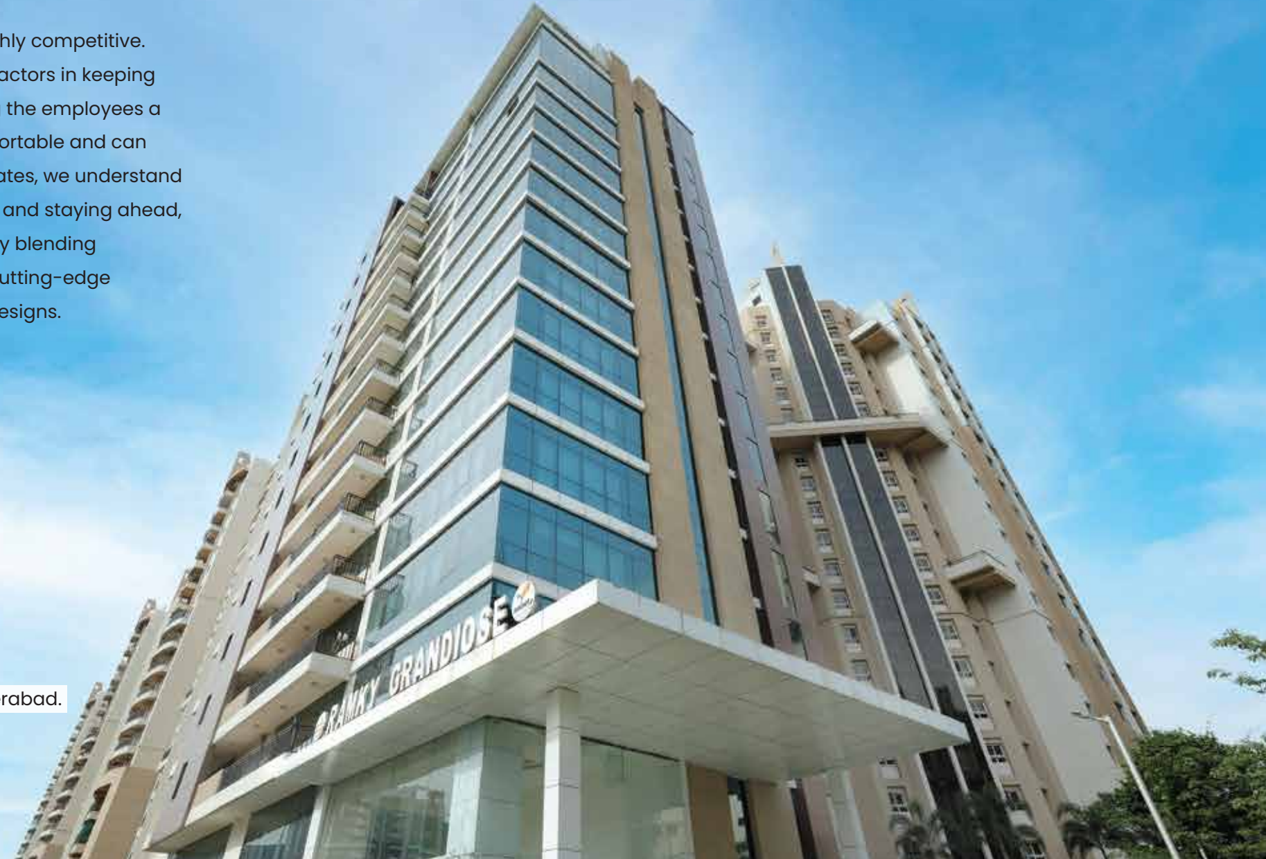
Ramky Towers-Grandiose, Hyderabad.

Today the corporate world is highly competitive. And one of the most important factors in keeping up with the competition is giving the employees a workspace where they are comfortable and can perform their best. At Ramky Estates, we understand this need of staying competitive and staying ahead, and use it to build workspaces by blending State-of-the-art technologies, cutting-edge concepts, and out-of-the-box designs.