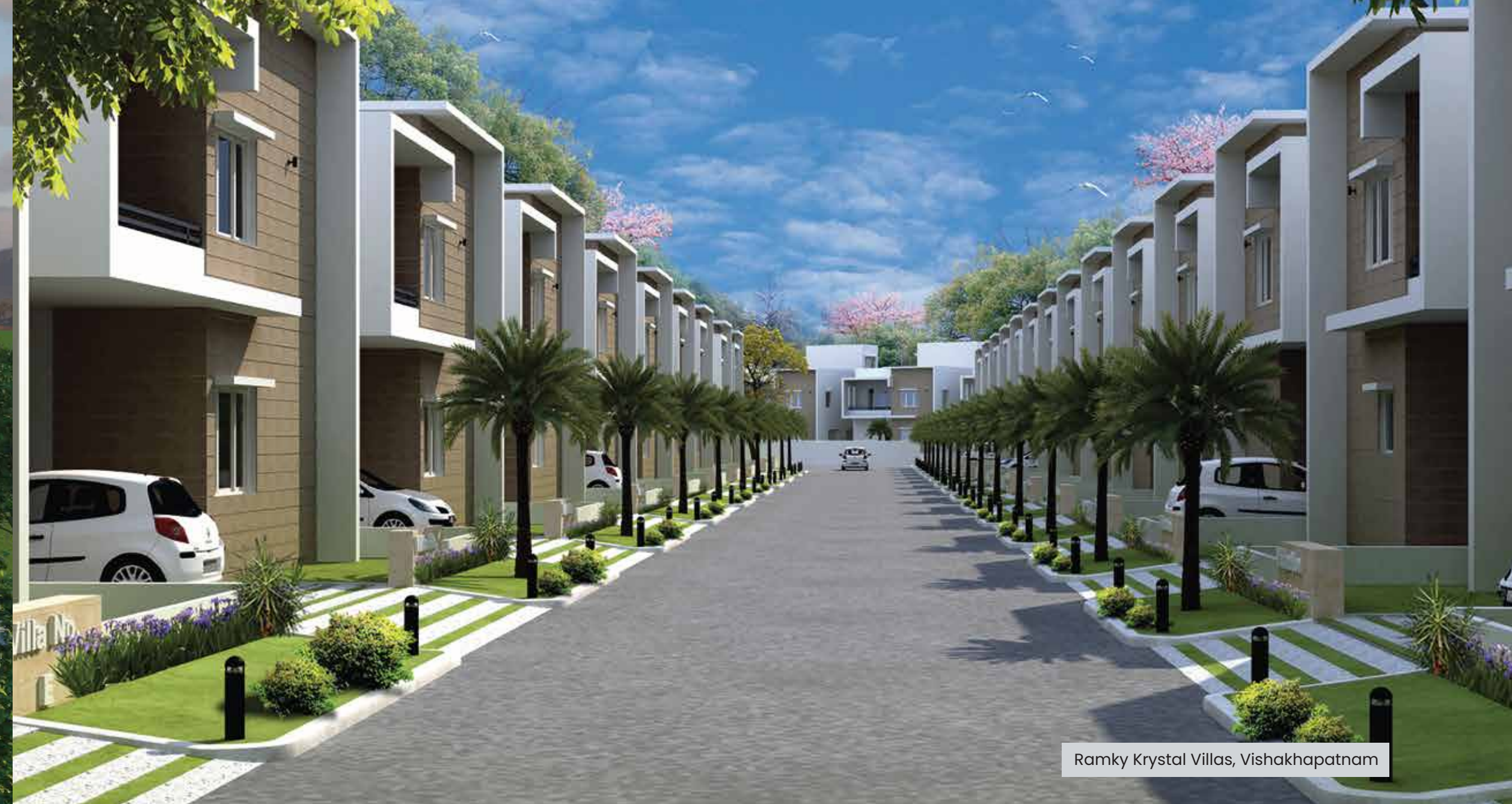
Ramky Krystal Villas, Vishakhapatnam