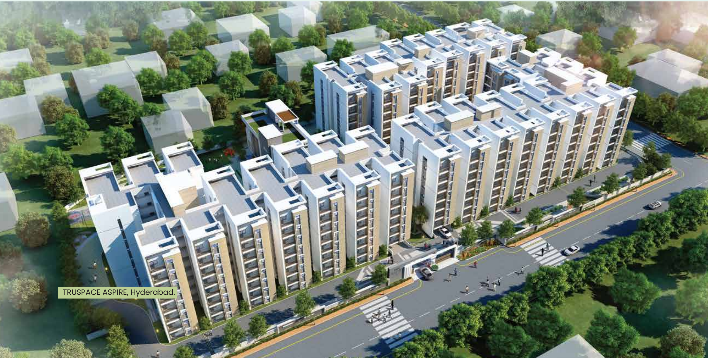
TRUSPACE ASPIRE, Hyderabad.

Recognising the importance of affordable housing, Ramky creates no-compromise residential spaces that are a boon to India's massive, upwardly mobile demographic.