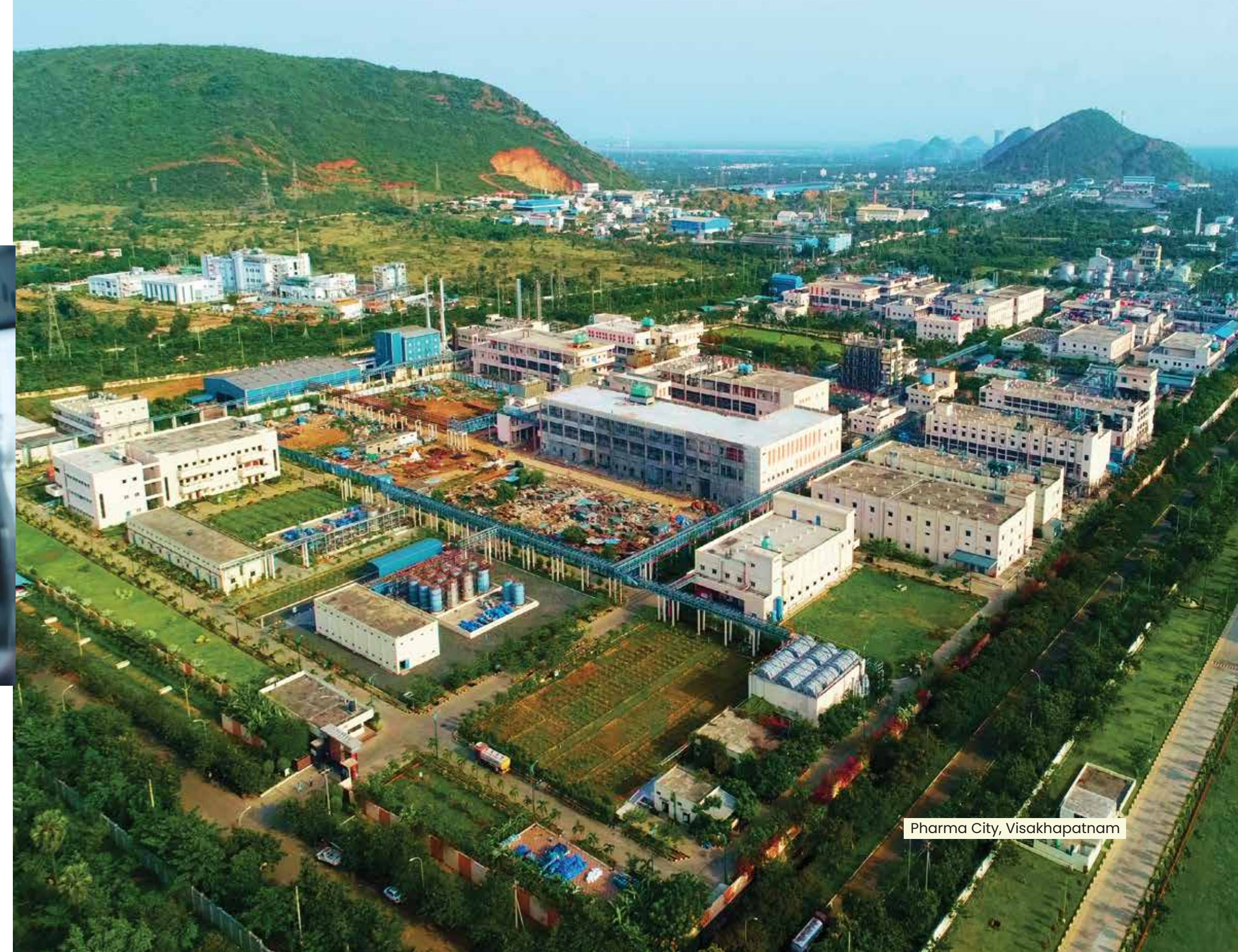
Pharma City, Visakhapatnam