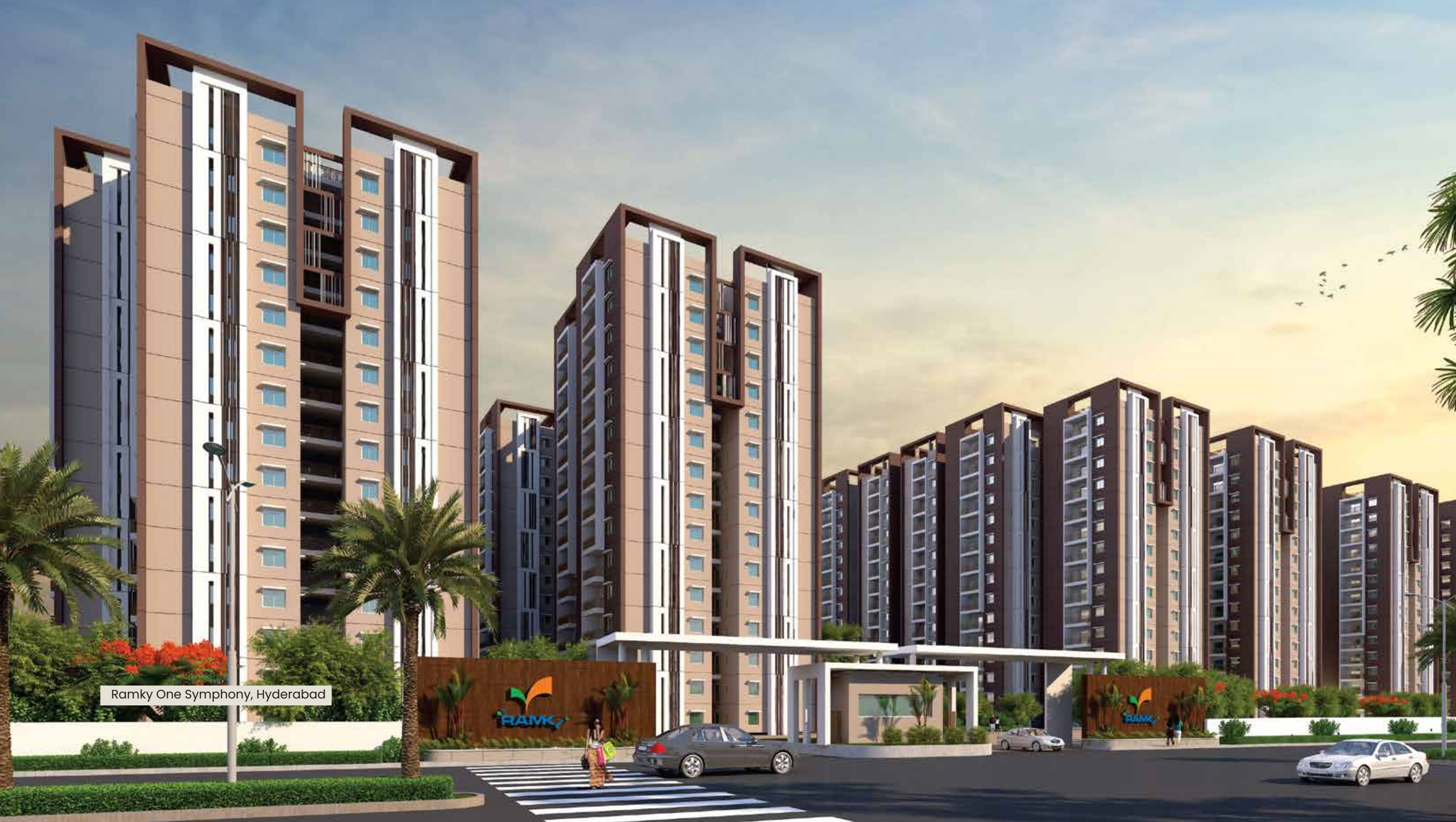
Ramky One Symphony, Hyderabad