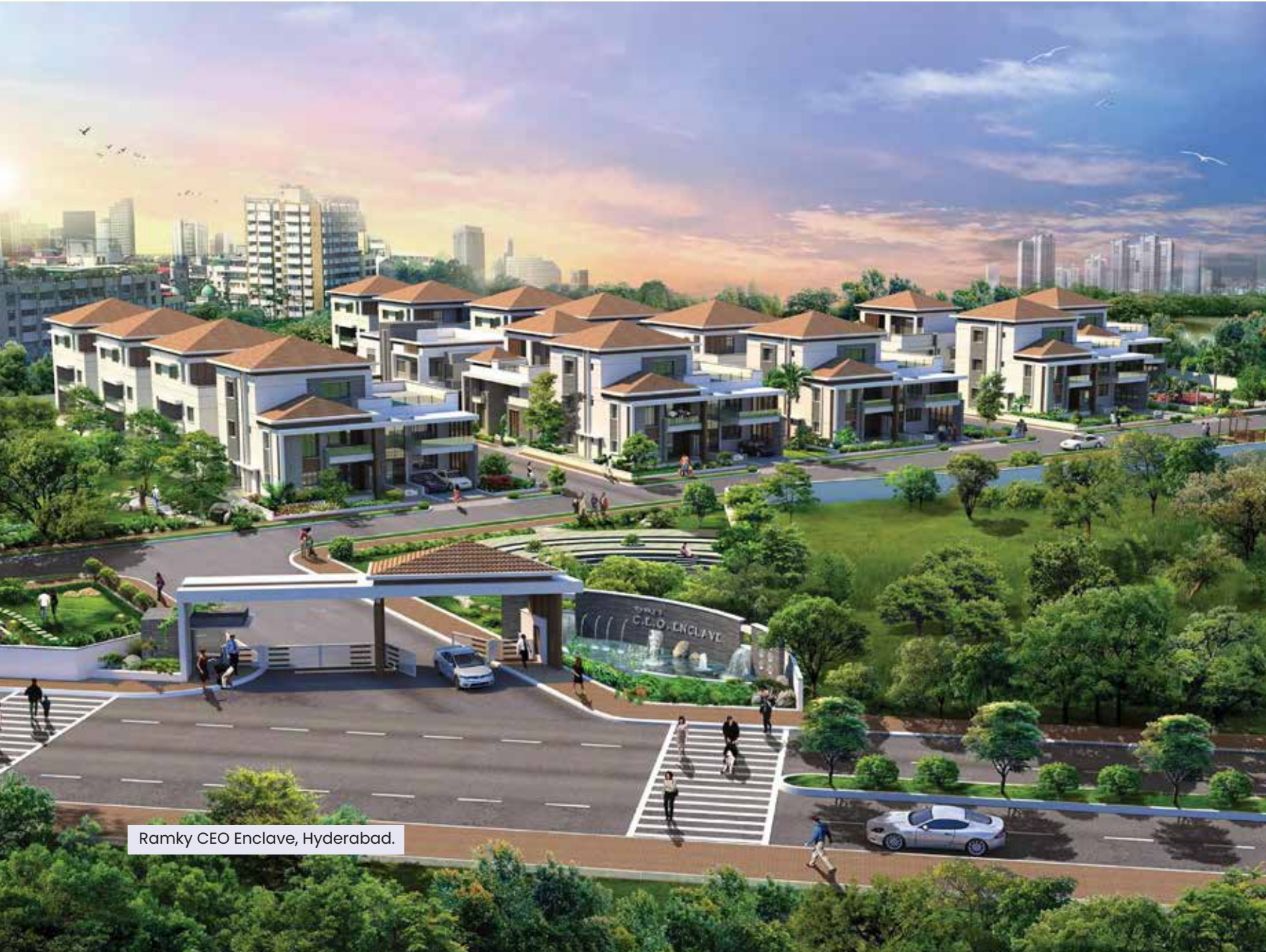
Ramky CEO Enclave, Hyderabad.