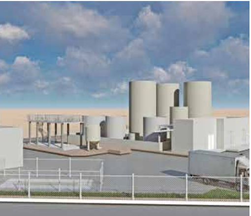
Gulf Region's 1st MARAPOL Plant, Dubai UAE