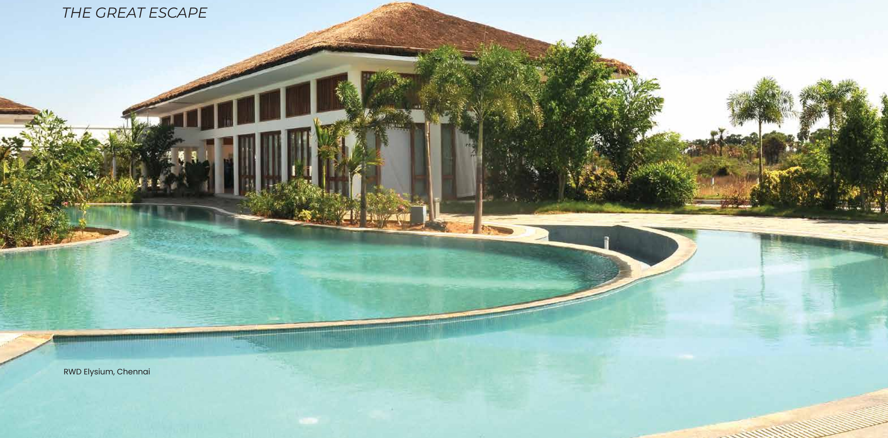
RWD Elysium, Chennai