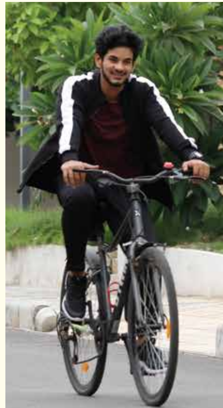
Ramky One Karnival, Bengaluru.