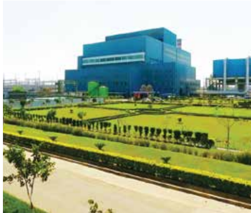
24 MW India's largest Waste to Energy Facility, Narela, Delhi