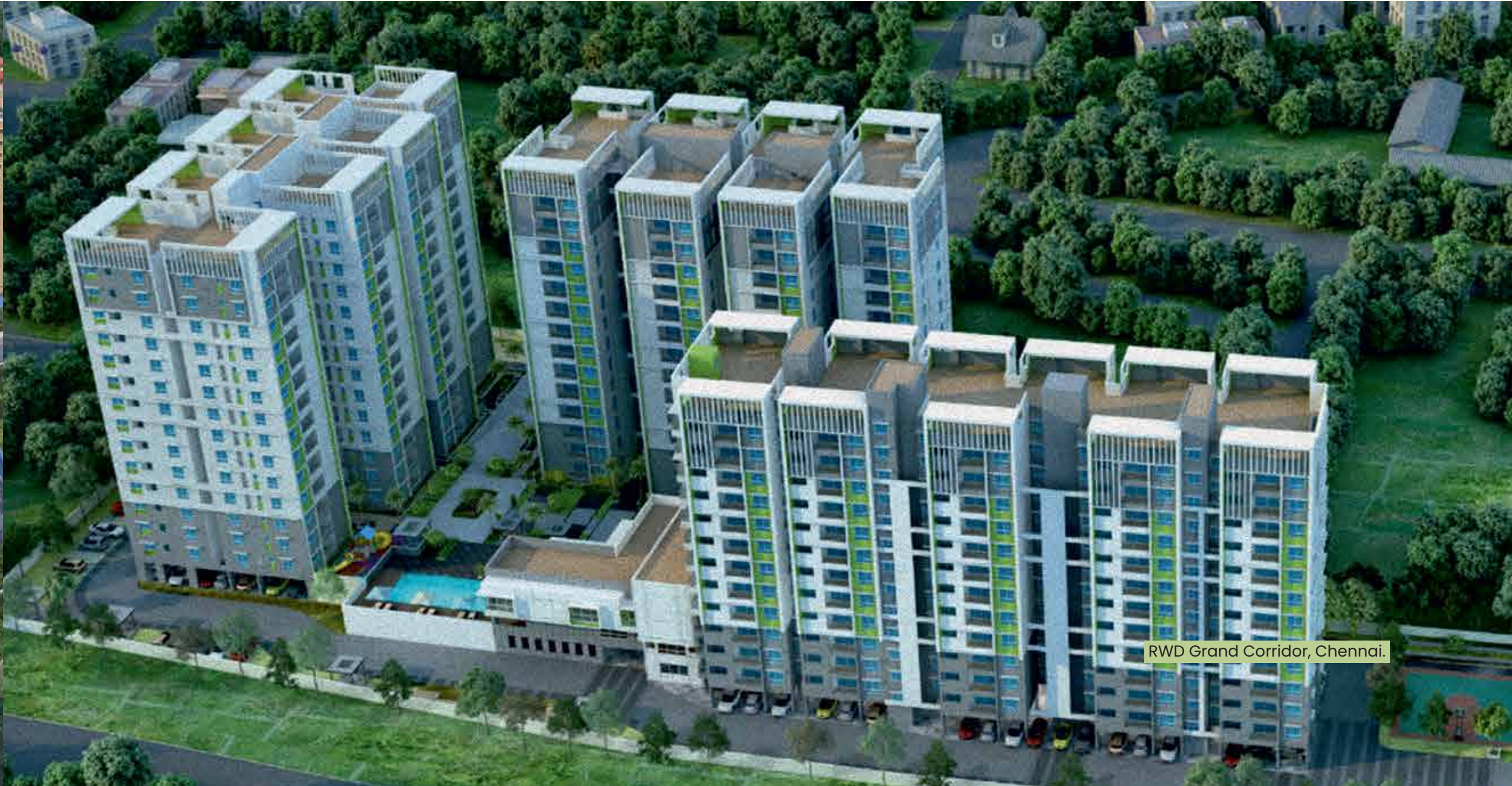
RWD Grand Corridor, Chennai.