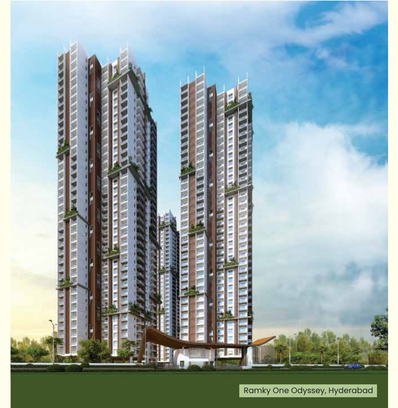
Ramky One Odyssey, Hyderabad