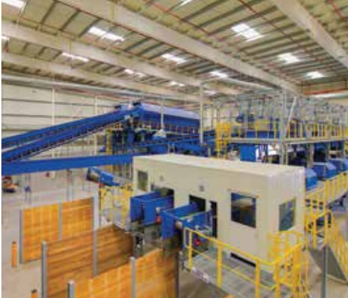
Fully Automatic Material Recovery Facility (FARZ), Dubai, UAE