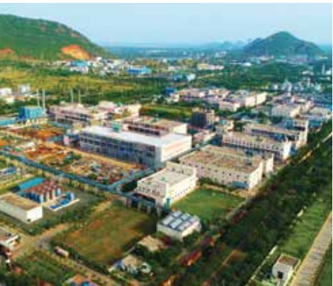
Ramky Pharmacity, Vishakhapatnam