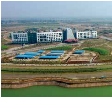
NRDA Capitol Complex, Naya Raipur, Chattisgarh