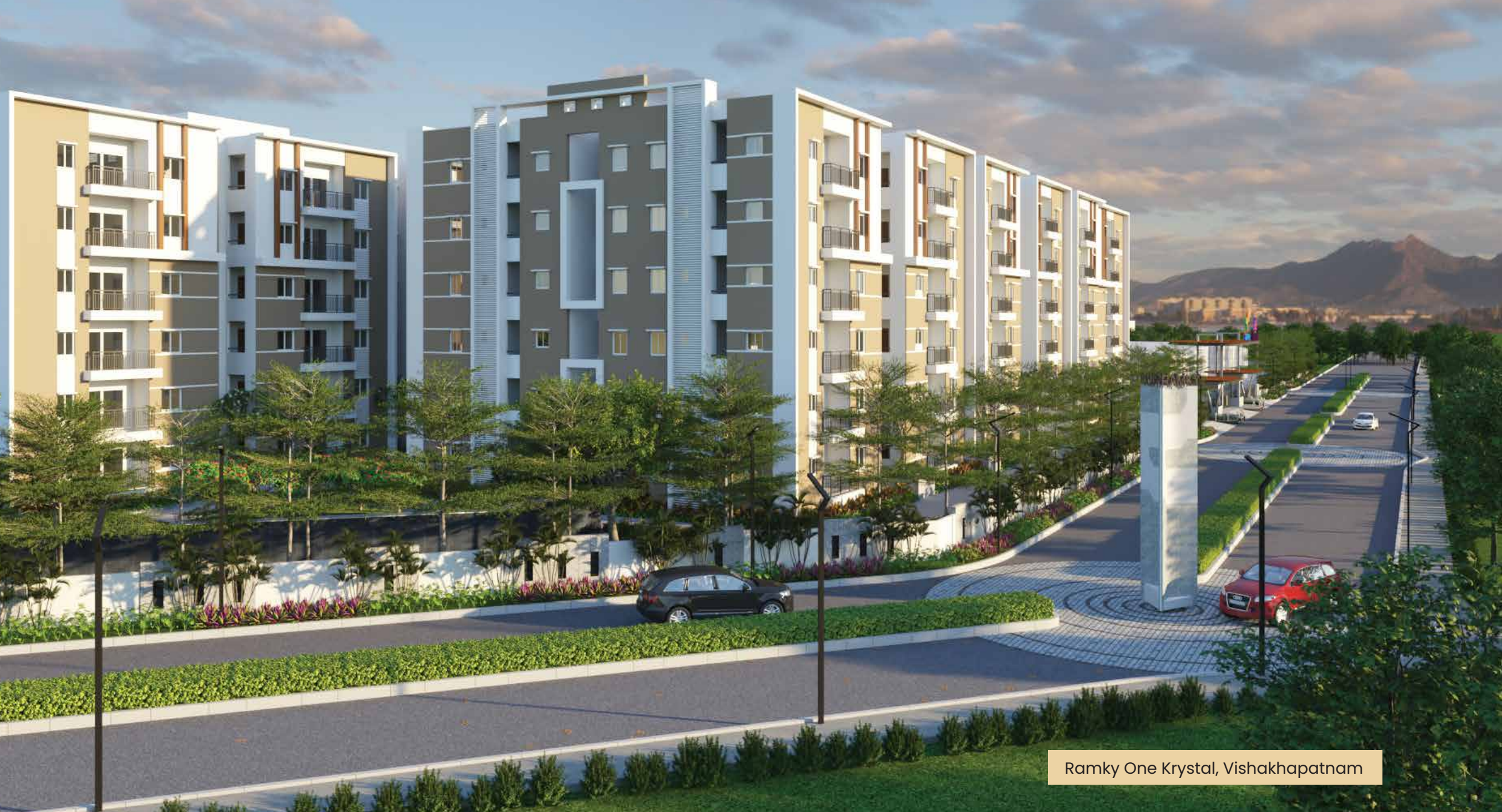
Ramky One Krystal, Vishakhapatnam