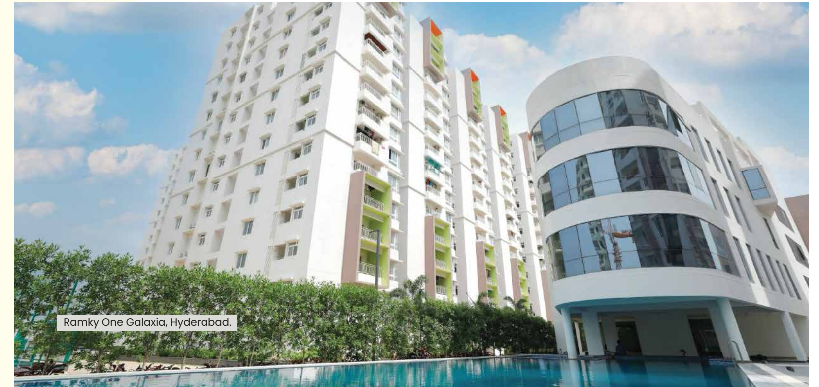
Ramky One Galaxia, Hyderabad.