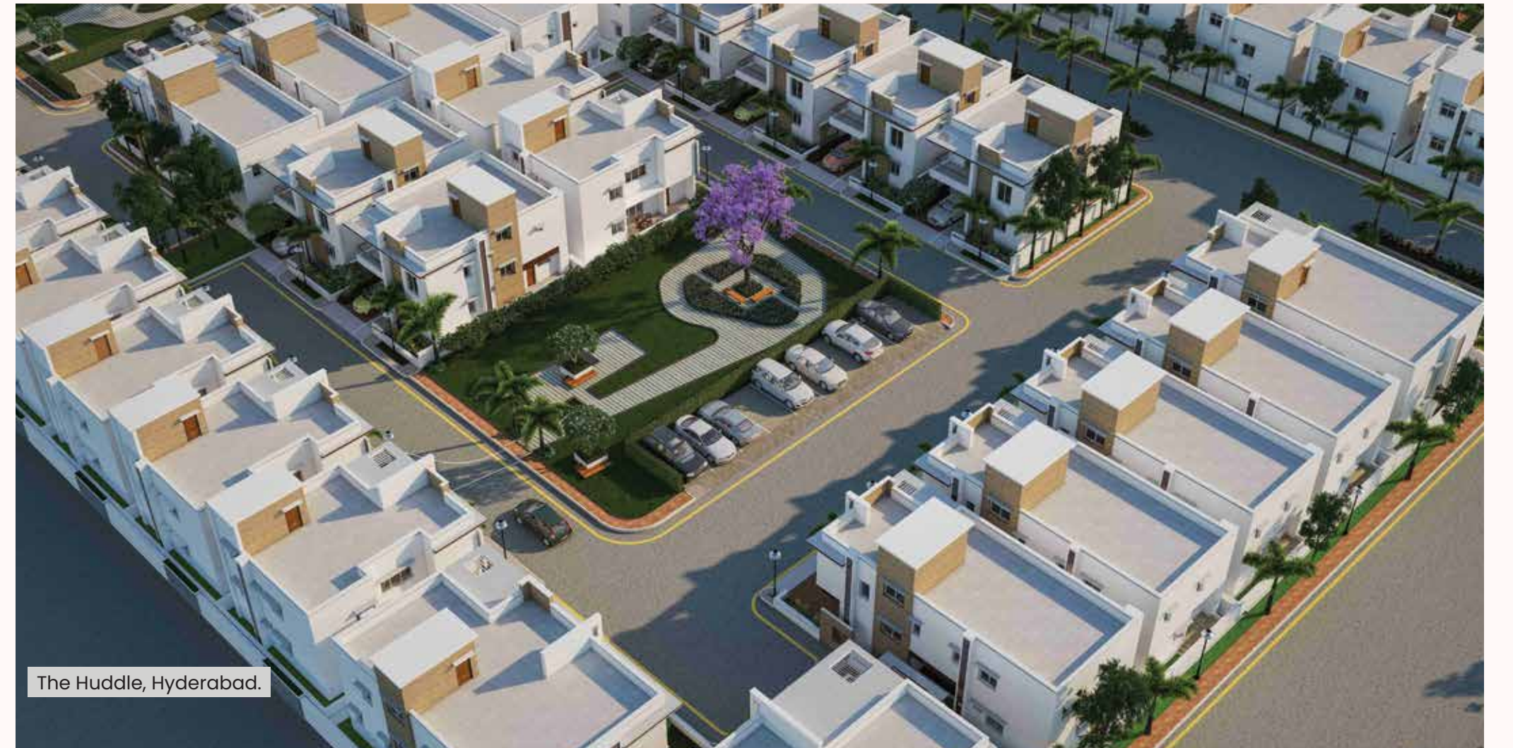
The Huddle, Hyderabad.