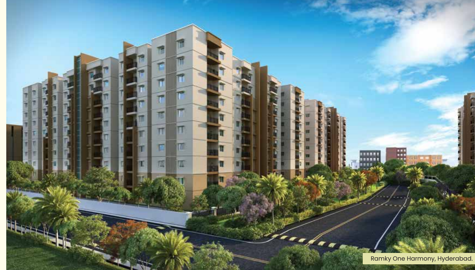
Ramky One Harmony, Hyderabad.