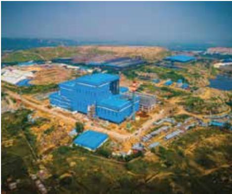
19.8 MW South India's First Largest Waste to Energy Facility, Hyderabad